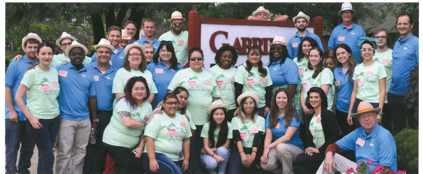
The Gabriel Environmental Team